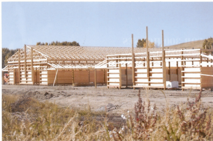
Anderson Ranch is under construction. Two of their four new barns are shown here.

It is easy to see why Anderson Ranch is becoming, and will remain, a mainstay in the Canadian show jumping scene in the years to come. Development of their facility and the riders and horses that compete remains the primary focus of the management team.